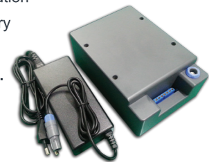
[ Battery pack & Charger ]